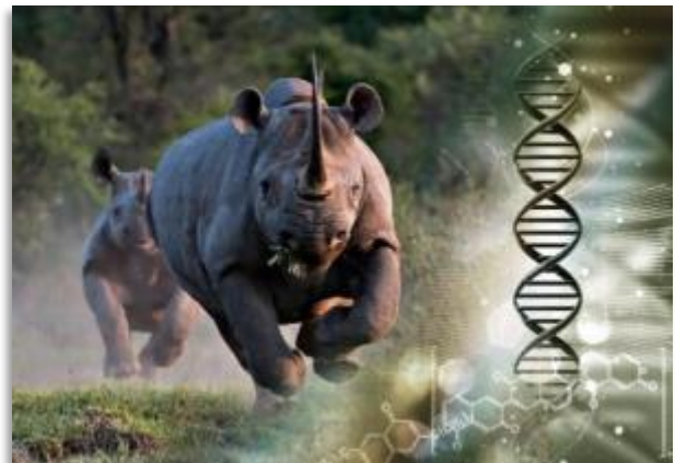
DNA sampling is being used to help combat rhinoceros poaching and illegal trade in rhinoceros horn. For more information, see: http://www.cites.org/eng/news/pr/2013/20131106_forensics.php .