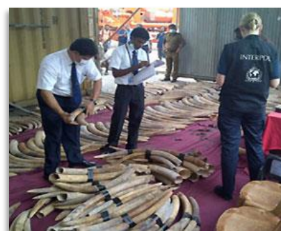
ICCWC WIST (Wildlife Incident Support Team) in action in Sri Lanka preparing to take DNA samples from a large-scale ivory seizure.

ICCWC's capacity-building programme is supported by the knowledge gained through in-country implementation of the ICCWC Toolkit along with knowledge of common gaps and weaknesses in enforcement responses. The five organizations have extensive experience in developing and delivering comprehensive training programmes for law enforcement officials, ranging from hands-on workshops to e-learning modules. ICCWC also has the operational capacity to deploy enforcement staff or relevant experts at the request of a country, to provide investigative assistance and support law enforcement efforts in the absence of relevant national capacity 12 .