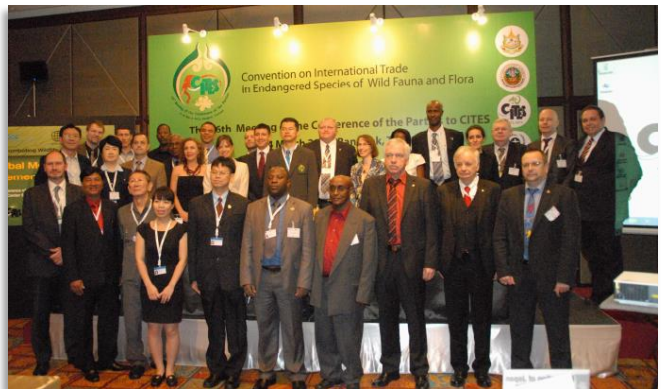
Participants at the first global meeting of Wildlife Enforcement Networks held during CITES CoP16 in Bangkok, Thailand, in March 2013. The meeting was convened by ICCWC with the generous support of the US Department of State. For more information, see: http://www.cites.org/eng/news/sundry/2013/20130715_wen_report.php .

With the different – yet complementary – mandates of the five organizations and their comprehensive network of regional field offices, ICCWC is uniquely placed to promote and facilitate collaborative approaches to wildlife crime. In addition, ICCWC's experience in real-time communication and information exchange tools – such as INTERPOL's I-24/7 Global Police Communication System and databases, and the WCO Customs Enforcement Network (WCO CEN) and WCO ENVIRONET 10 – provides a strong foundation for facilitating more effective sharing and use of information.