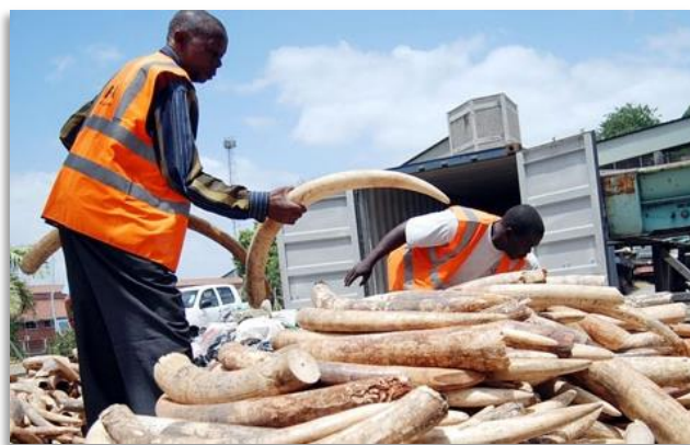
Ivory seized during Operation COBRA II, a global enforcement operation that took place in January 2014 and involved 28 countries. For more information, see: http://cites.org/eng/news/sundry/2014/20140210_operation_cobra_ii.php .

Reflecting the scale and urgency of the threat, there is increasing recognition of the serious nature of wildlife crime, the risks that it poses, and the need for enhanced and coordinated responses. Recent political attention has focused on recognizing illegal wildlife crime involving organized crime groups as a serious organized crime 3 that accordingly demands a determined and coordinated response equal to that deployed against other transnational organized crimes such as trafficking of narcotics, humans or arms. Recent high-level events and summits, including those in New York 4 , Gaborone 5 and London 6 , have helped secure increased international and national political support to combat wildlife and forest crime.