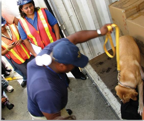
Joint UN Office on Drugs and Crime/ World Customs Organization container control programme: containers at the port of Balboa, Panama City. For more information, see: https://www.unodc.org/ropan/en/BorderControl/container-control/ccp.html

ICCWC's mission is to usher in a new era where the perpetrators of serious wildlife crimes face a formidable and coordinated response