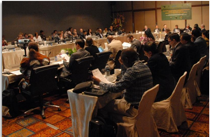
High-level representatives during an ICCWC Ministerial Roundtable on Combating Wildlife Crime held during CITES CoP 16 in Bangkok, Thailand, in March 2013, with the generous support of Sweden. For more information, see: http://www.cites.org/eng/news/pr/2013/20130305_ministerial.php .